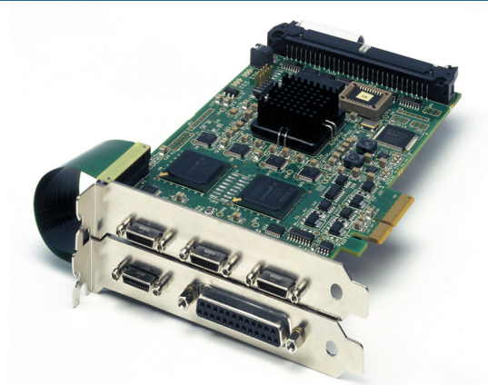
BitFlow > Frame Grabbers > Neon-CL