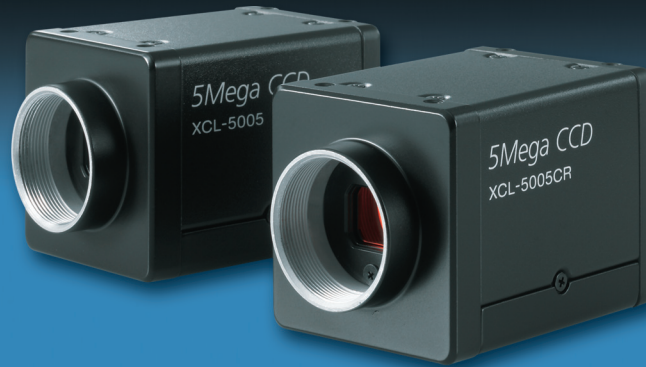
XCL-5005 B/W Digital Camera